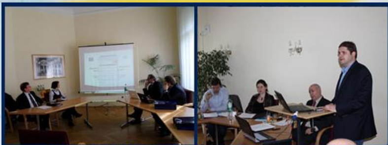
WORKSHOP "BRAIN DRAIN-BRAIN GAIN" (LEIPZIG, APRIL 2010)

The project started with the parallel work on a complex database of the Moldovan Medical Diaspora in the EU (Germany) and on a Study on the strengths and the weaknesses of the Moldovan Health System (the State Medical and Pharmaceutical University "Nicolae Testemitanu", (SMPHU) Republic of Moldova). At the workshop organized in Leipzig with the participation of Moldovan partners and physicians activating in Germany and wishing to participate in carrying out the project