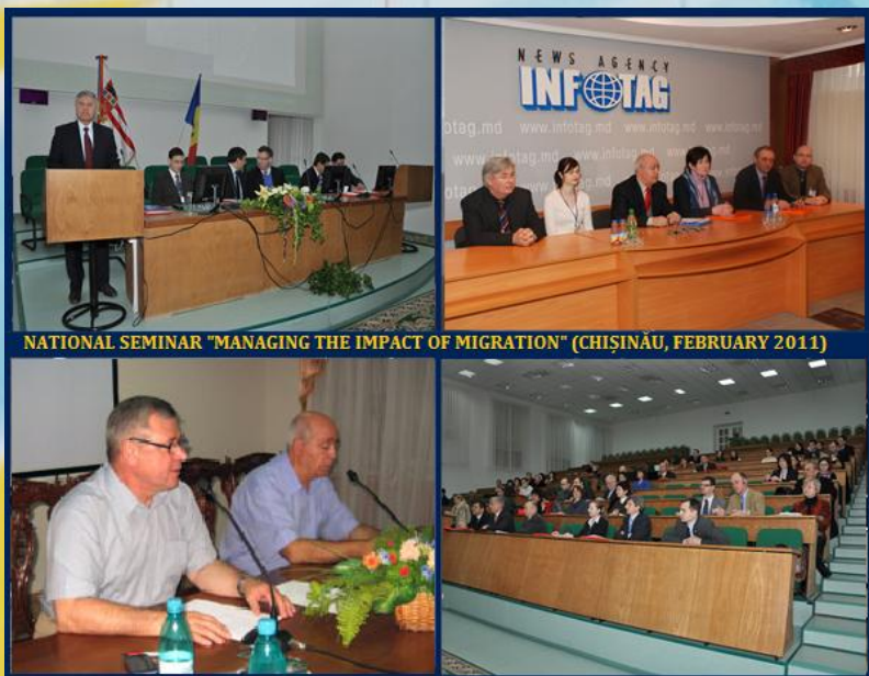
NATIONAL SEMINAR "MANAGING THE IMPACT OF MIGRATION" (CHIȘINĂU, FEBRUARY 2011)

We present you the representatives of medical Diaspora in Germany who during 18 months formed a team of enthusiasts with a motivation and a big wish to contribute to the development of Moldovan Health System. They are the pioneers of a project which is, in fact, at the very beginning, but in our view, has a great perspective.